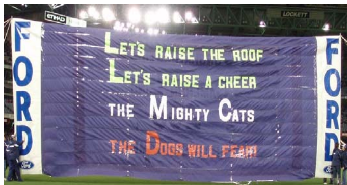
Round 21 – Western Bulldogs (Back)