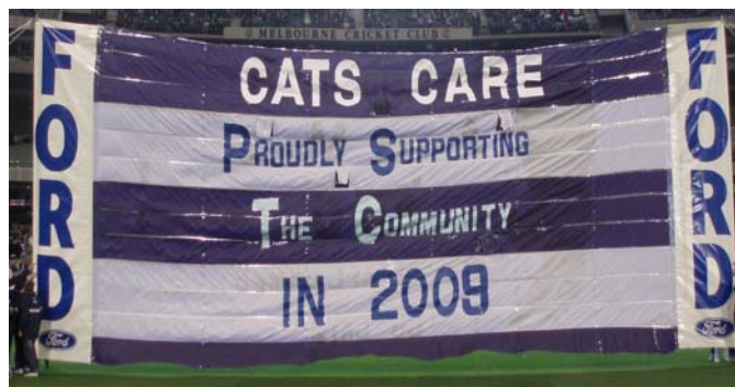
Round 19 – Carlton (Back)