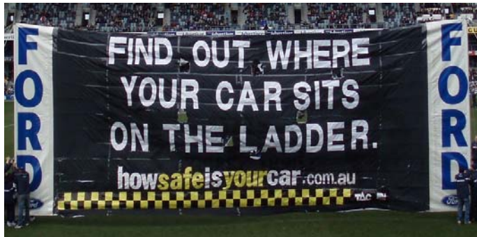
Round 18 – Adelaide (Back)