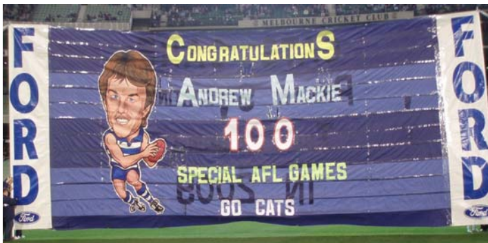
Round 19 – Carlton (Front)