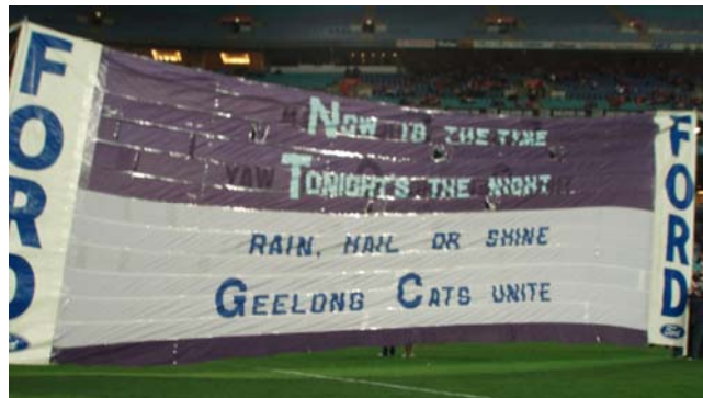
Round 20 – Sydney (Back)