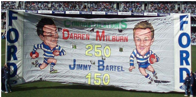
Round 18 – Adelaide (Front)

The banners from the last month were as follows: