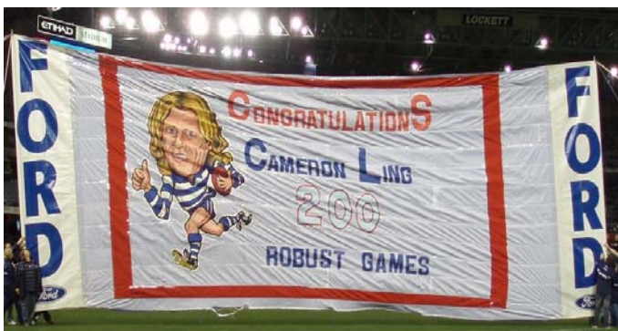
Round 21 – Western Bulldogs (Front)