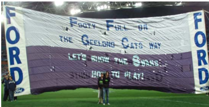
Round 20 – Sydney (Front)